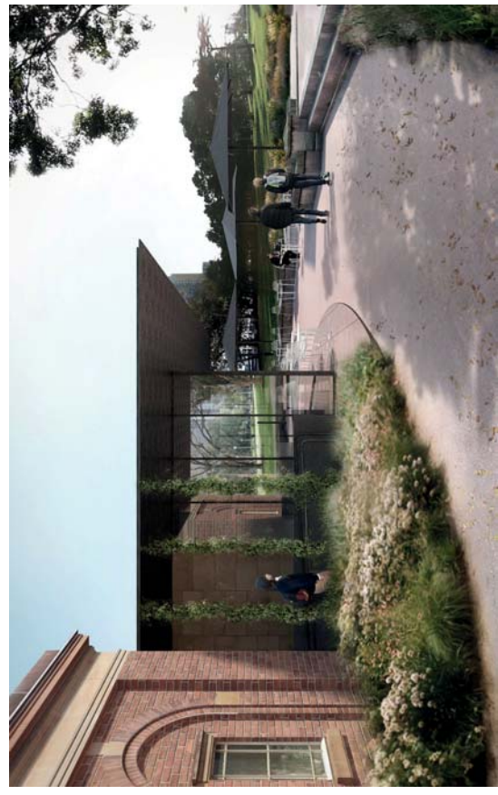
View A from south east

The heritage setting around the café will also be upgraded as a part of the project. Significant heritage fabric will be retained. New works include landscaping, paths and stairs. These works will provide an accessible route from the Museum Station and Liverpool Street to the café and the park. A new paved terrace will accommodate alfresco café seating within a parkland setting.