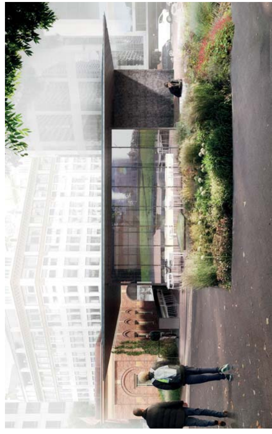
View B from north east